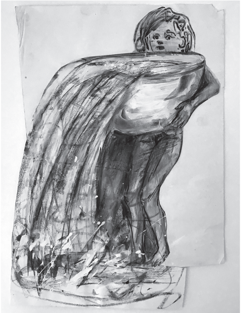
Coy, J. (1989). Libations 2 . Japanese ink-block on paper; 23x17 in.