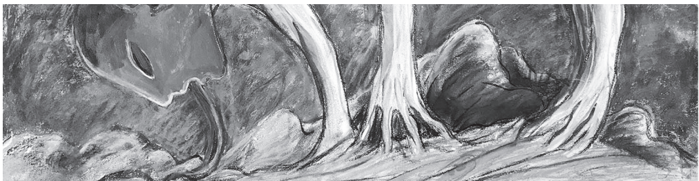
Coy, J. (1989). Earth Spirit (detail). Acrylic paint & Japanese ink-block & pastels on paper. Approx. 20x14.5 in.